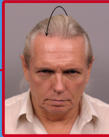
Front to back tilt