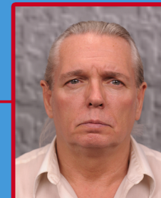
Texture or objects in background