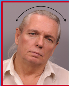
Side to side tilt