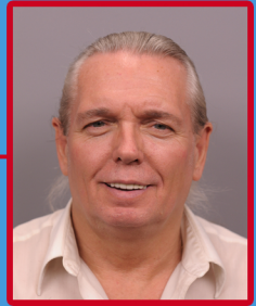
Smile or grimace, mouth open