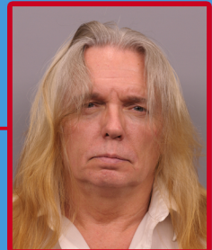
Obstructions to face hair, glasses, piercings, dirt, blood, excessive make-up

When possible, long hair should be tied back or at least tucked behind ears.