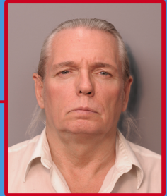
Shadows on background