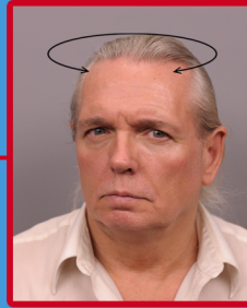
Side to side rotation